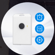
Multiple working mode