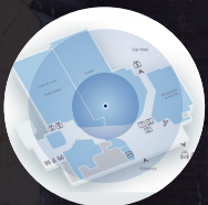
Long wireless transmission distance