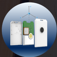
Build-in accelerometer sensor