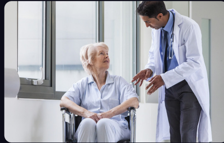
Nursing Home Personnel Management