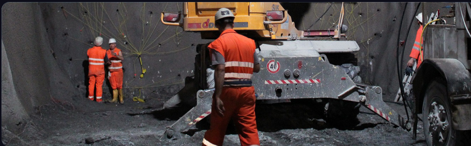
Construction Site Personnel Management