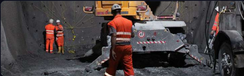
Construction Site Personnel Management