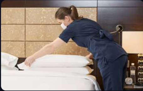
Hotel Personnel Management