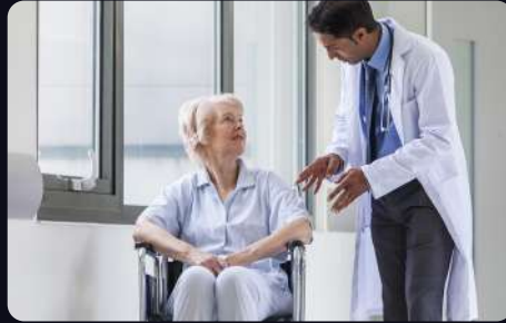
Nursing Home Personnel Management