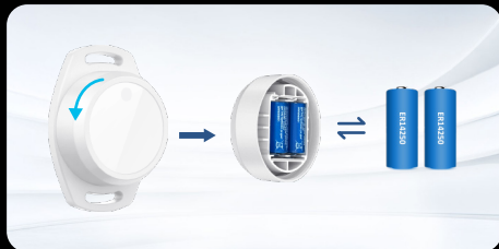
Rotating replaceable battery