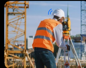
Safer construction site