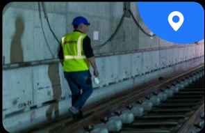
Personnel Tracking & Positioning