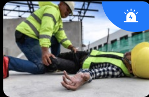
Press the button for emergency help