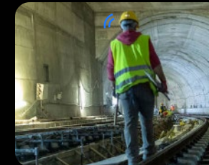
Positioning and Evacuation in the Mining Industry